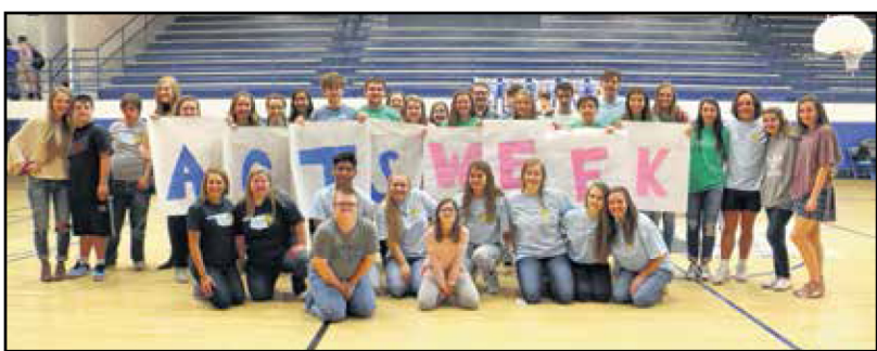
The student council at Mount St. Mary Catholic High School hosted "ACTS Week" (Assisting Charities Through Service Activities) to raise money for the Down Syndrome Association of Central Oklahoma. The theme for the week was Dr. Seuss, and the quote for the week was, "Unless someone like you cares a whole awful lot, nothing is going to get better. It's not." Students raised more than $6,000.