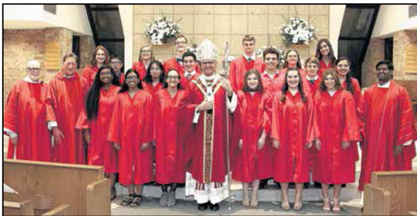
The 2018 Confirmation class for the Church of the Epiphany of the Lord in Oklahoma City. They were confirmed Nov 17.