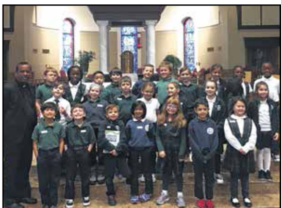
Second grade students from the Catholic School of St. Eugene participated in First Reconciliation on Nov. 13.