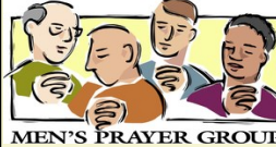
MEN'S PRAYER GROUP

Come join us at 3 PM on Sunday in the Parish Hall.